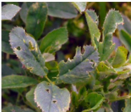
Figure 1. Tip feeding damage by alfalfa weevil larvae.