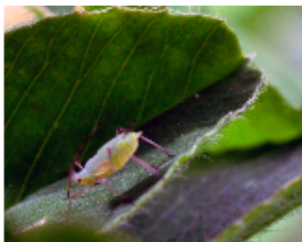
Figure 3. Pea aphid on alfalfa leaf.